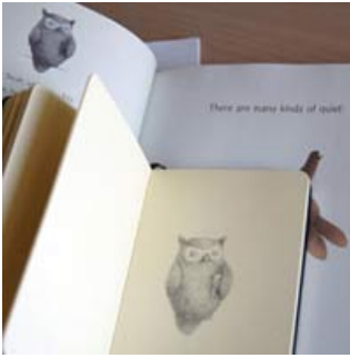
A small sketchbook for a small drawing.