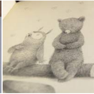
The owl gets emotional in the final drawing.