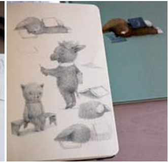
Some of these guys got left out of the book.